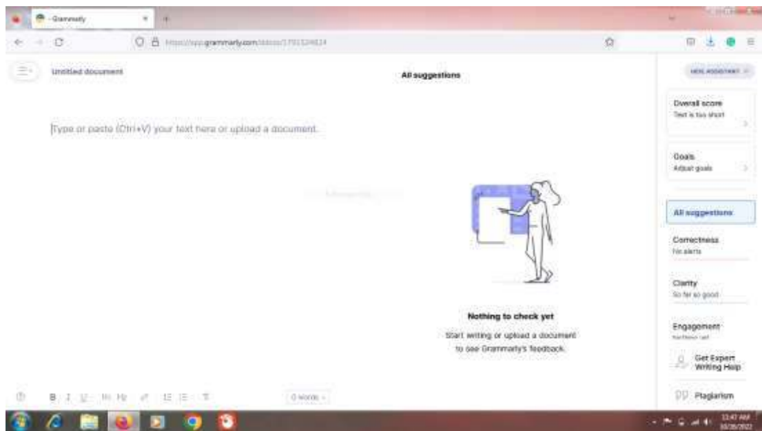
Figure 2.1 Grammarly application function

This application actually makes it possible for users to type in English without worrying about using incorrect grammar, in keeping with the slogan "Type with Concidence." The purpose of this application is to find spelling and grammar mistakes in English. Grammarly's purpose is to correct bad writing. Therefore, Grammarly will immediately and automatically identify the error and correct it. Grammarly's products are powered by an interconnected system that incorporates rules, advancements, and artificial intelligence techniques like machine learning, deep learning, and natural language processing. A computer-