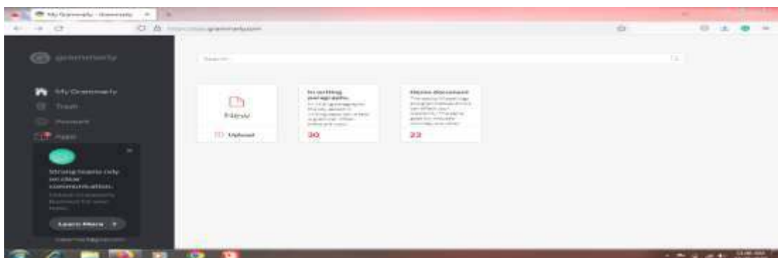
Figure 2.3 Grammarly main menu

Only the file or text that Grammarly wants to correct needs to be uploaded. This application will automatically scan the document, check it, and tell you which parts need to be fixed. Before starting the scan, this application will also bring up a Pop Up Window that asks questions about what part the user wants to target. Starting in terms of formal/informal, descriptive/explorative, academic writing, casual, and many more. That way, Grammarly will adapt to your needs and correct the structure and vocabulary in your document. The Grammarly software is useful for helping students and teachers correct EFL writing (Ghufron & Rosyida, 2019).