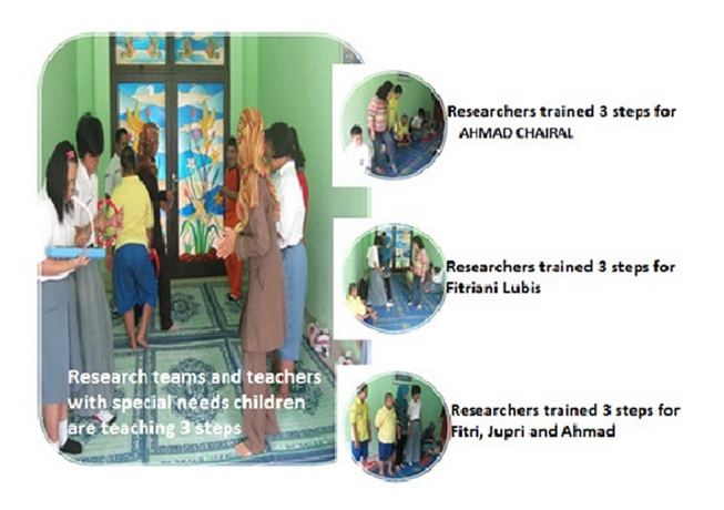
Figure 7. Teaching 3 Steps

amount of patience, as well as the force to instill discipline, in order to ensure that the children followed orders. This exercise helped discern the objective that musical drama can help children work with people around them and also improve their creativity.