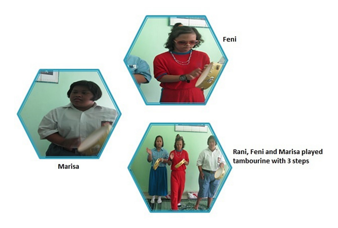
Figure 4. Children trained to play Rhythm on a Tambourine with 3 steps