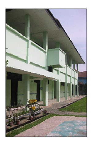
Figure 1. Image of the YPAC Building Medan 2015

donation of land area of 4,574 m. at No. 2 Adinegoro, Medan from the city's mayor Dr. Syurkani. The Medan Branch of the YPAC confirmed its establishment on February 5, 1972 through the decree of the Board of Foundation No. 19 / SK / PH / YPAC / 85. In accordance with Law Decree No. 16 of 2003 regarding the foundation, the Medan Branch of the YPAC changed its status to the YPAC in Medan based on the notarial deed of Henry Tjong, SH No. 31 dated February 18, 2004 (Brochure YPAC [Ibid.]). The YPAC slogan is "Disability Does Not Determine the Capabilities of Anyone." The YPAC Medan trainers are provided with comprehensive services in the institution, namely, the Child Rehabilitation Center (PRA) (according to the YPAC Brochure [Ibid.]).