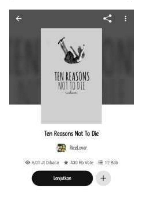
Figure 3.2 View Stories on Wattpad