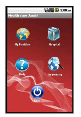
Figure 3. Main Menu

The implementation of the system using Android versi 2.3 (Gingerbread). Implementation results of this study showed the main menu, health information and health shortest path of the application. Those can bee seen in Figure 3 and Figure 4.